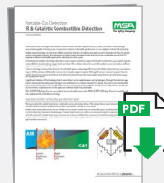
IR & Catalytic Combustible Detection