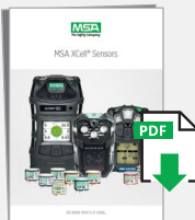
MSA XCell® Sensors