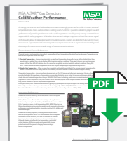
MSA ALTAIR® Gas Detectors: Cold Weather Performance