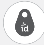
MSA id Tag