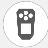
ALTAIR io 4