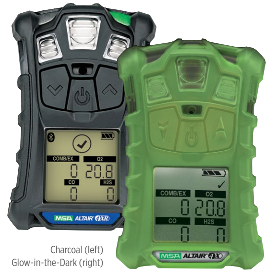
Charcoal (left) Glow-in-the-Dark (right)