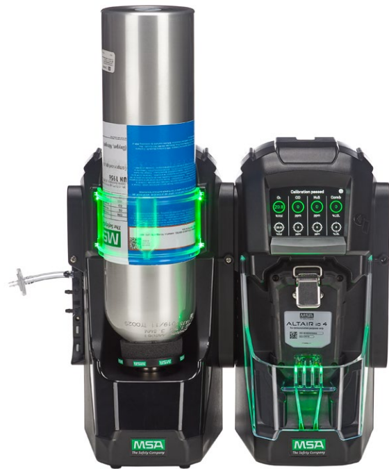
ALTAIR io Dock Test Stand & Cylinder Holder (top) ALTAIR io Charge smart charger (bottom)