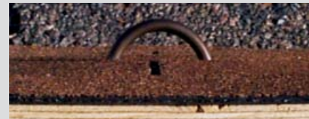
Low profile and heat treated makes the Permanent Roof Anchor less obtrusive.