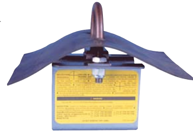
Permanent Roof Anchor 2" x 4" P/N 10016468