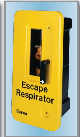
Two unit and single unit wall mounting case—chemical-resistant ABS plastic case resist weathering, moisture, and corrosion to ensure escape respirators stay in ready-to-use condition.

Note: This bulletin contains only a general description of the products shown. While uses and performance capabilities are described, under no circumstances shall the products be used by untrained or unqualified individuals and not until the product instructions including any warnings or cautions provided have been thoroughly read and understood. Only they contain the complete and detailed information concerning proper use and care of these products.