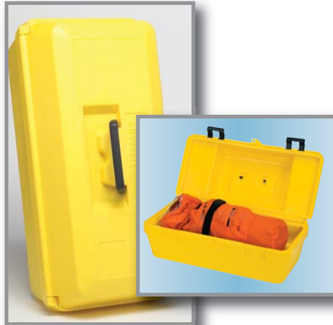
Single unit carrying case