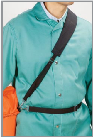
Optional wide shoulder strap