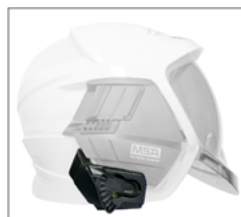
Right lamp bracket