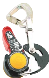
Latchways TowerLatch™ System