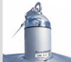
Latchways Constant Force® Post

Note: This Bulletin contains only a general description of the products shown. While uses and performance capabilities are described, under no circumstances shall the products be used by untrained or unqualified individuals and not until the product instructions including any warnings or cautions provided have been thoroughly read and understood. Only they contain the complete and detailed information concerning proper use and care of these products.