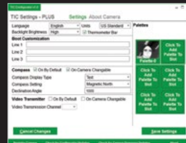
Camera Configuration Application