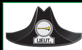
XFI Front Plate, Lieut. w/1 trumpet (GA1150-N4)