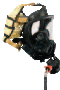
Ultra Elite Facepiece with Firehawk Slide-To-Connect (STC) MMR