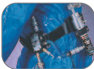
PremAire System with vortex tube option