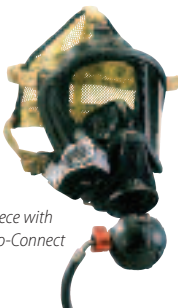
Ultra Elite Facepiece with Firehawk Push-To-Connect (PTC) MMR