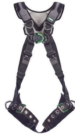
V-FLEX Standard Full-Body Harness w/Front D-Ring