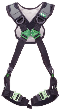
V-FLEX Standard Full-Body Harness