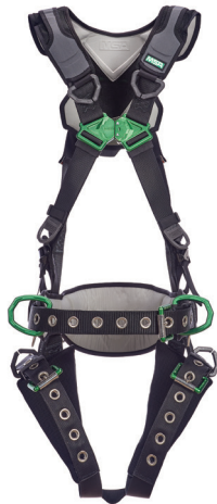
V-FLEX Construction Full-Body Harness