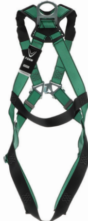
V-FORM Standard Harness with stainless steel hardware (P/N 10197234)