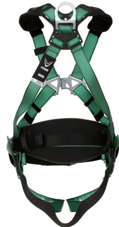
V-FORM Construction Harness (P/N 10197364)