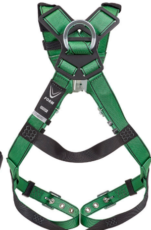
V-FORM Harness with Quick-Connect Racing-Style Buckle (P/N 10206058)