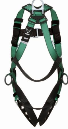
V-FORM Harness with front D-ring (P/N 10197207)