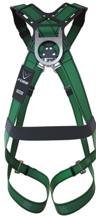
V-FORM Standard Harness with Quik-Fit™ buckles (P/N 10196642)