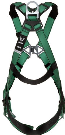
V-FORM Standard Harness with tongue buckles (P/N 10196642)