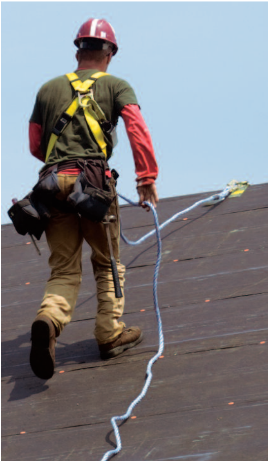
Reusable Roof Anchor installed at peak